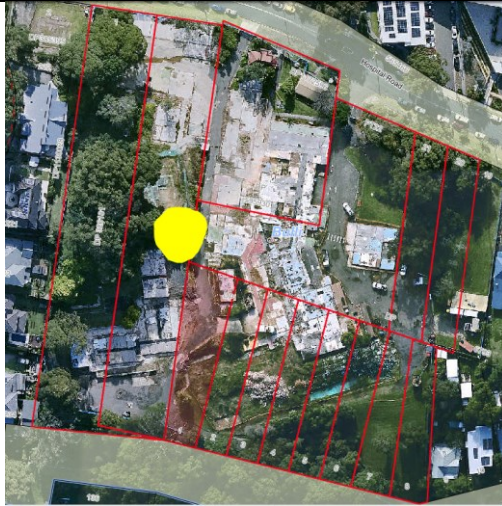
Yellow dot = approximate location