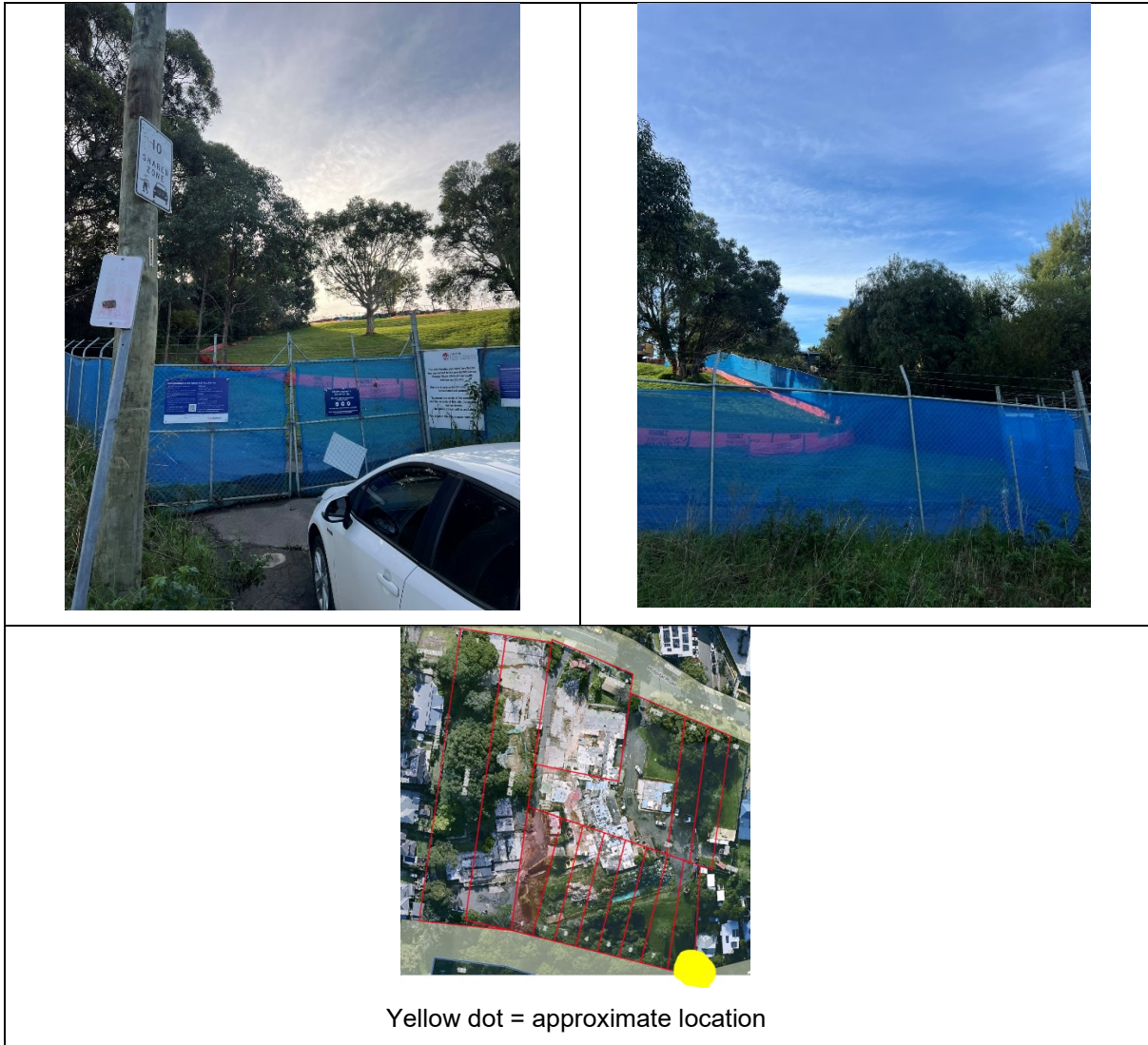
Yellow dot = approximate location