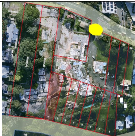
Yellow dot = approximate location