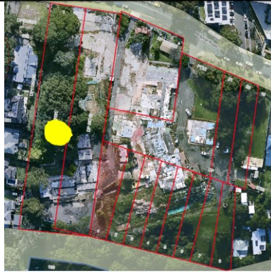
Yellow dot = approximate location